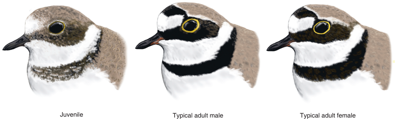
Fig. 3. Head and breast pattern of juvenile, typical adult male and typical adult female Little Ringed Plover (drawings by Cezary Wójcik).

in the first breeding plumage (ringing codes: EURING = 5; North American = SY); such birds should have also very worn primaries. Other birds in breeding plumage should be aged as older than one year (ringing codes: EURING = 4; North American = AHY), but the majority of those with only moderately worn primaries are probably older than two years (ringing codes: EURING = 6; North American = ASY). After post-breeding and post-juvenile moult, the only certain feature of birds in the first winter or first breeding plumage is retained juvenile inner median coverts (ringing codes: EURING: up to 31 December = 3, after 31 December = 5; North American = HY or SY respectively). Birds with no such inner medians cannot be reliably aged in winter, i.e. they could be adult or first year (ringing codes: EURING: up to 31 December = 2, after 31 December = 4; North American = U or AHY respectively).