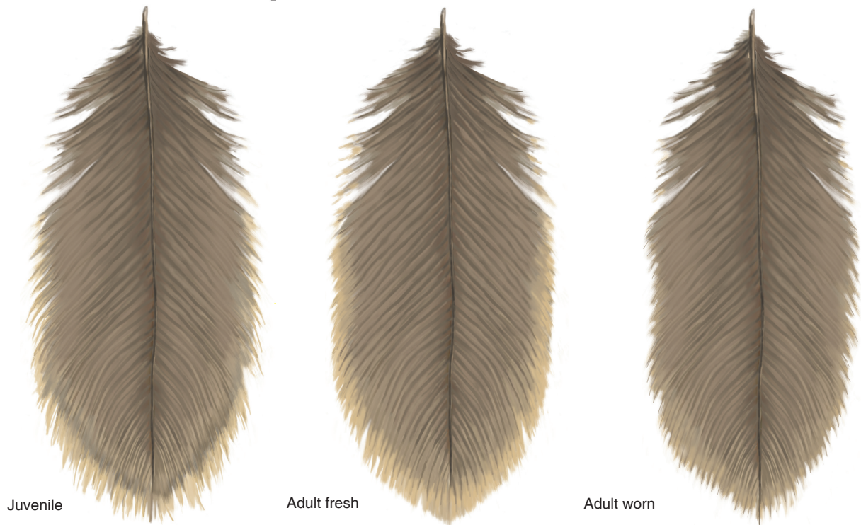
Fig. 2. Inner median coverts of juvenile and adult Little Ringed Plover (drawings by Cezary Wójcik).