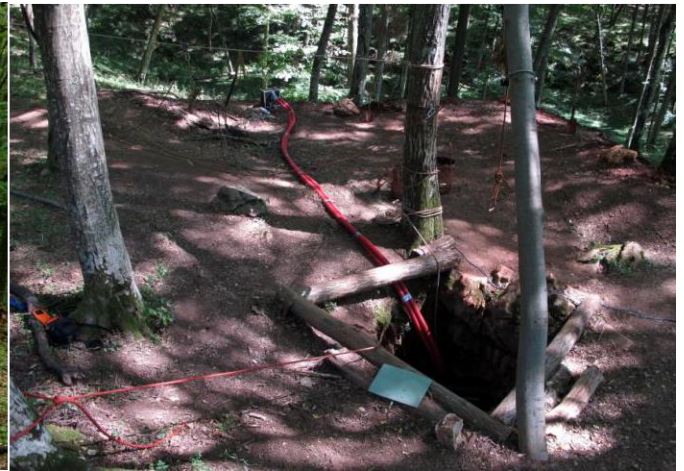
Author: Mišo Varhola (2017)