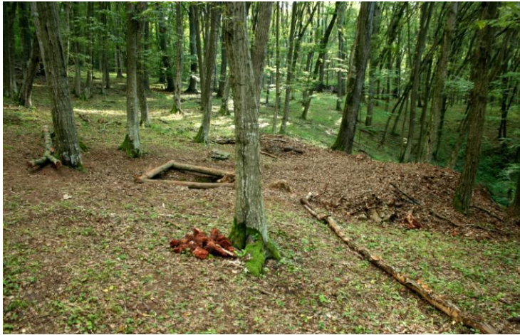
Author: Mišo Varhola (2016)

Description: The entry is located in oval sinkhole with dimensions of 3 × 4 m and 0,5 m depth. The entry has irregular shape with dimension of 1,5 × 1,5 m. The southern edge is lined with small rocks. The entrance is formed with 3 m deep stem. Below this step, there is a passage leading under angle of 50°. This part changes in the depth of 9 m into a vertical shaft leading up to 17 m depth. Here the bottom leads to the west, where is a hole leading into the last vertical part. The total depth is 27 m, the bottom is loamy without any sign of continuation. The abyss partly has small decoration, the loamy sediments are crusted. The entry requires speleological equipment.