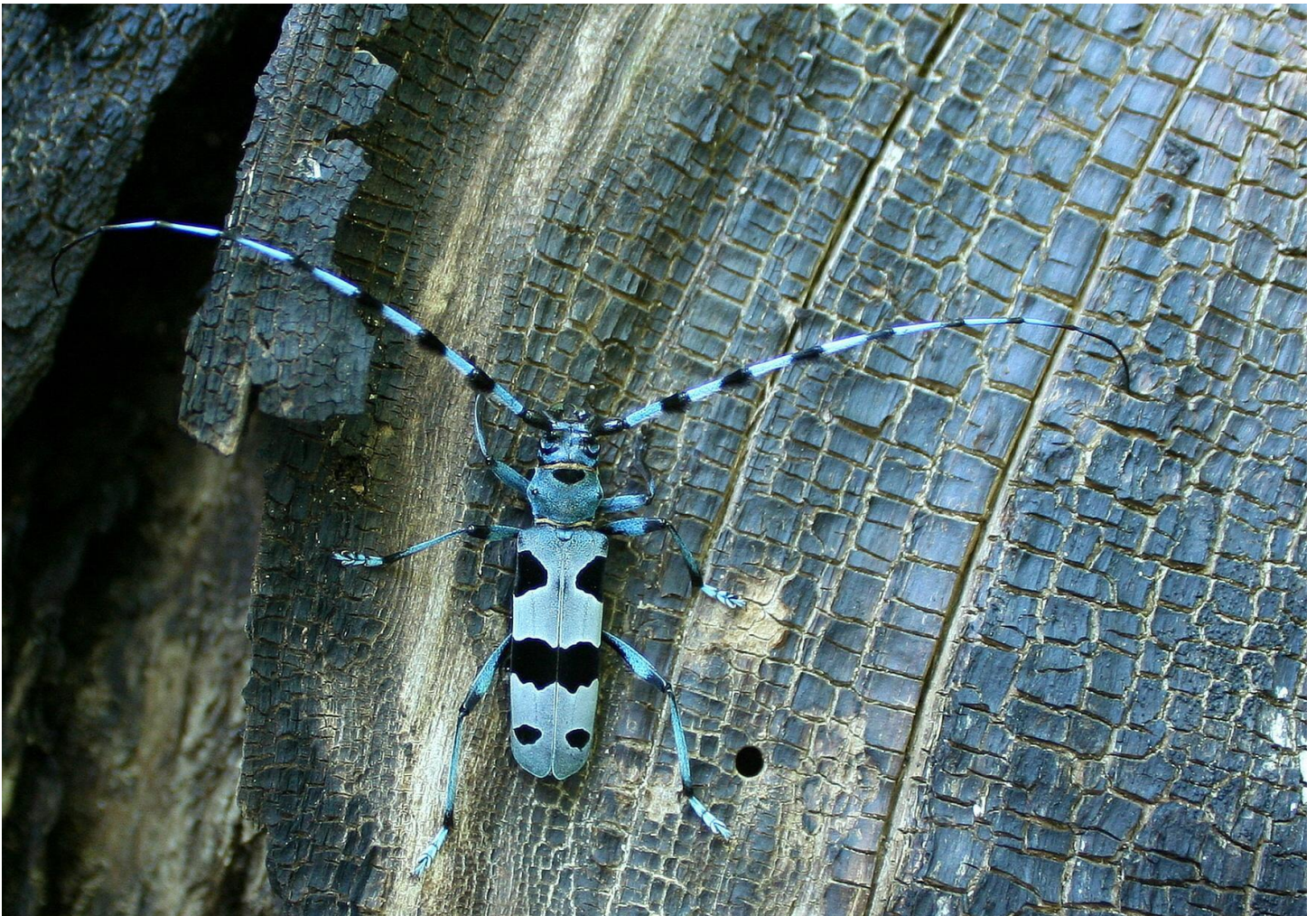
author: Mišo Varhola