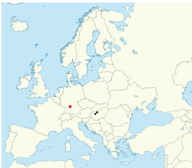
Fig. 1. Map of Europe showing the collection site of Ixodes ariadnae in Germany (red dot) and its formerly reported occurrence in Hungary (black dots)

On 6 March 2015 a long-legged tick was removed from a greater mouse-eared bat ( Myotis myotis ), hibernating in a natural cave at the north rim of the river Bühler valley (49.1550° N and 9.9272° E, ca. 400 m above sea level, northwest of the village Hopfach, Baden-Württemberg, Germany). The collection site is shown in Fig. 1. The authorisation number for bat handling is 55-8850.68/SHA (issued by the Regierungspräsidium Stuttgart Abteilung Umwelt).